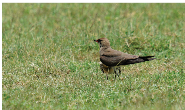
50. Adult Collared Pratincole with a chick photographed in May 2024 at Kalewadi, Ujani Reservoir, Maharashtra.

These repeated observations over two years suggest that Collared Pratincoles may be regular breeding visitors to Ujani, but overlooked due to their similarity with Oriental Pratincoles. This finding considerably extends the known breeding distribution of the species into the Deccan Plateau and highlights the ecological importance of large, seasonally fluctuating wetlands for supporting ground-nesting birds.