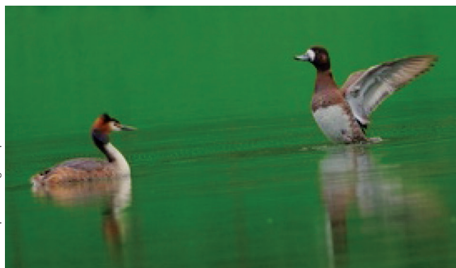
220. The Greater Scaup (right) with the Great Crested Grebe (left).