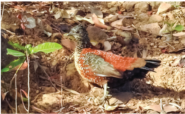
163. Male Painted Spurfowl.