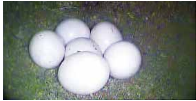
117. Eggs of Blue-eared Kingfisher (Clutch ID 2).

All the eggs hatched between 20–23 days with a median of 21 days. The attending