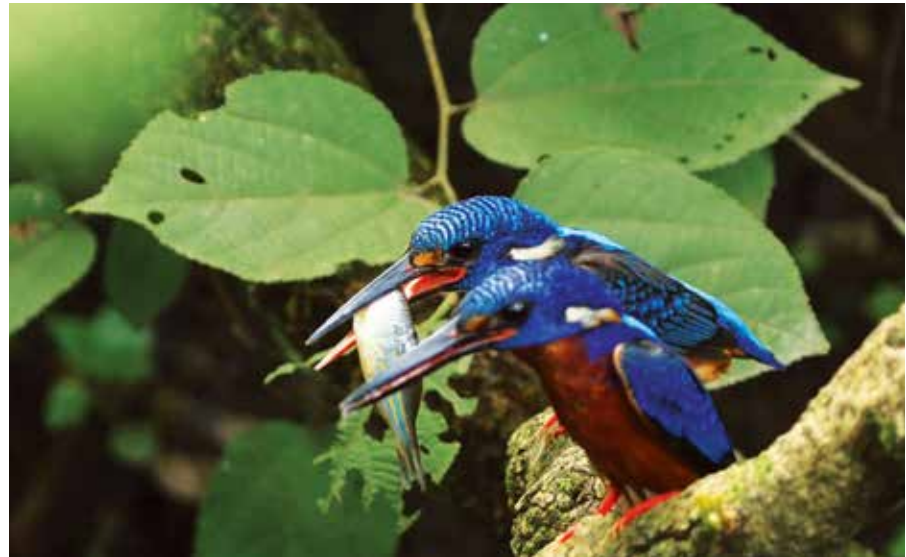
118. Female holding the fish after courtship feeding at Nest DND.

parent removed the eggshells from the nest. The hatchlings were nidicolous [120]. Eyelids appeared large and black. The egg tooth was visible on the tip of the upper mandible. In all nests, the female stayed in the nest, with the chicks, for four–six days after they hatched. The fledging period was between 20–27 days with a median of 23 days (Table 2).