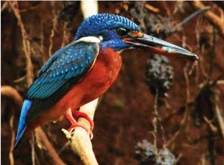
114. Female Blue-eared Kingfisher (with dusky-red lower mandible) at Kalsute.

plush, and its proximity to the Koyana electric power generation plant ensures the area has water throughout the year. The major tree species here are mango Mangifera indica , teak Tectona grandis , Terminalia crenulata , T. bellirica , silk cotton Bombax ceiba , and jamun Syzygium cumini . Rice is the main crop in the study area. The south-west monsoon is active from June till the end of September. The cold season is from October to January, with the hot season following, and lasting till the beginning of the monsoon. The average temperature ranges between 23°C–40°C, while the annual rainfall during the study was 4532 mm in 2013, 3247 mm in 2014, and 2126 mm in 2015, obtained from department of water resources, Chiplun (Ram Vasudeo Mone, verbally, September 2015).