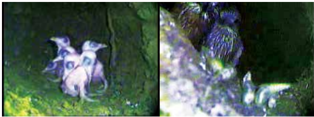
120. Hatchlings of Blue-eared Kingfisher on the first day (Clutch ID 11)