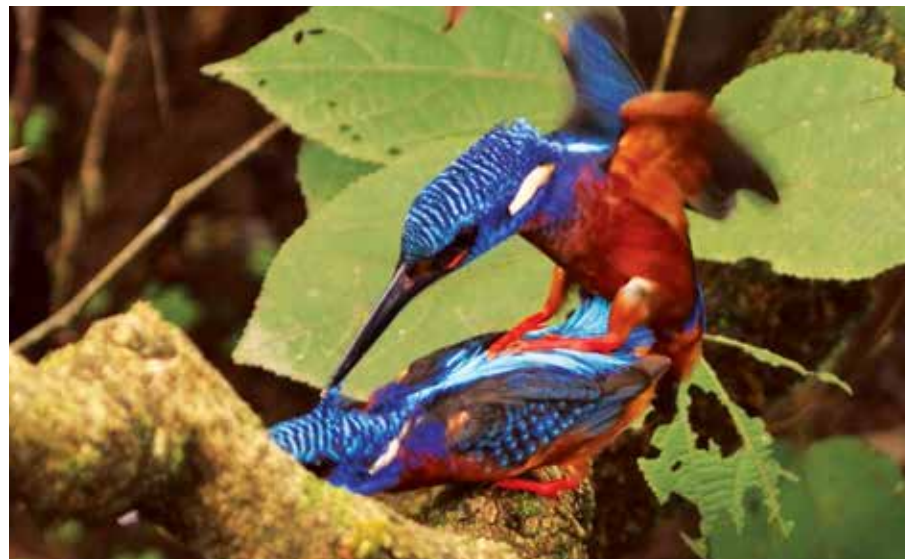
119. The pair copulating.