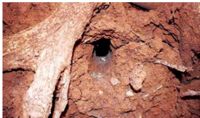
116. Nest DND from outside.