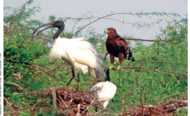
90. The Greater Spotted Eagle Clanga clanga perched on a tree Prosopis juliflora near to Black-headed Ibis Threskiornis melanocephalus nests.

This prompted us to do a literature survey for the distribution of this species in Tamil Nadu. Surprisingly, except Rahmani (2012), most other regional references (Naoroji 2006; Grimmett et al. 2011; Rasmussen & Anderton 2012) do not provide more than four distributional records in Tamil Nadu. The only previous summary of its status in Tamil Nadu was by Santharam (1999), which was nearly two decades ago. Hence, we intensively searched for, and collected, information on reliable distributional records of the species in Tamil Nadu, and Puducherry from various journals, books, newspapers, avian online forums such as eBird (http://ebird.org), Tamilnadu Birds—Yahoo Groups