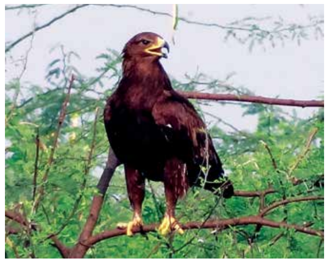
91. A close view of Greater Spotted Eagle Clanga clanga perched on Prosopis juliflora.

(https://in.groups.yahoo.com/group/TamilBirds), Facebook bird forums, and different photographic databases (Oriental Bird Images: http://orientalbirdimages.org; India Nature Watch: http://indianaturewatch.net; Internet Bird Collection: http://ibc. lynxeds.com; and Flickr: http://flickr.com). Based on our survey, we present here the distributional records of Greater Spotted Eagle in Tamil Nadu, and Puducherry (Table; Fig. 1).