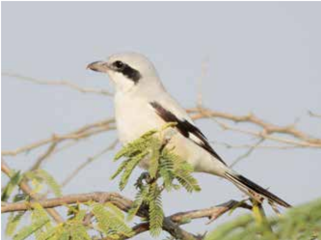
13. January 2015. Little Rann of Kachchh, Gujarat. Note the pale bill and lores, with a hint of pale supercilium behind eye. The underparts are distinctly washed with pink, which is noticeable in the field also. Long primary projection. Pale grey upperparts. This bird is typical of pallidirostris seen here.