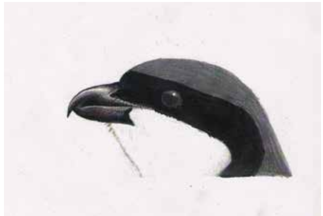
Fig. 2. Shrike head, dark.