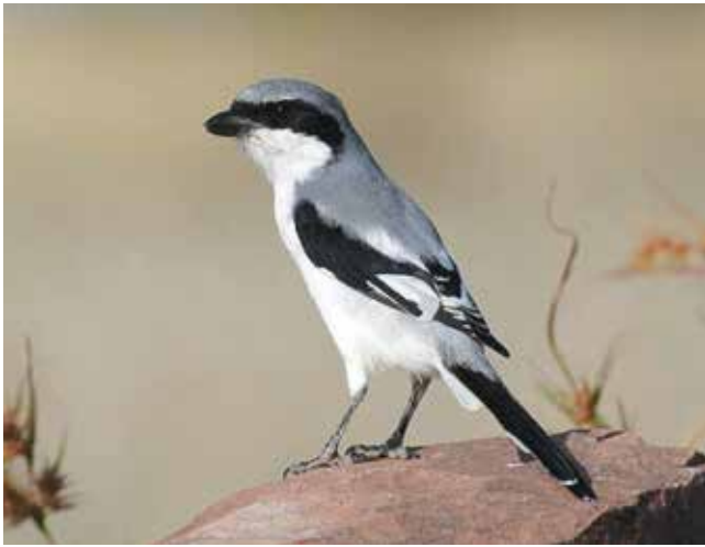
5. October 2014, Kota, Rajasthan. Note the dark smoky grey plumage, faint supercilium above eye and amount of white in wings. This bird is in moult, with outer tail feathers still growing.

Wings: The upper-wing pattern, when seen in flight, is considered important for identification, and special attention was paid to it, and whenever possible, it was photographed. Shrikes sometimes hold the inner wing semi-closed in flight, which makes it difficult to observe the pattern on the secondaries, and only a black patch is visible. But as far as possible, I tried to observe the fully stretched upper-wing in detail. I noted three types of wing patterns on lahtora (Figs. 3–5 2 ):