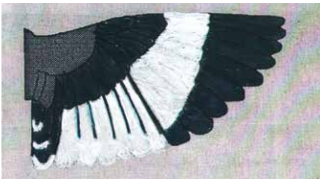
Fig. 4. Wing pattern of Great Grey Shrike—type 'b'.