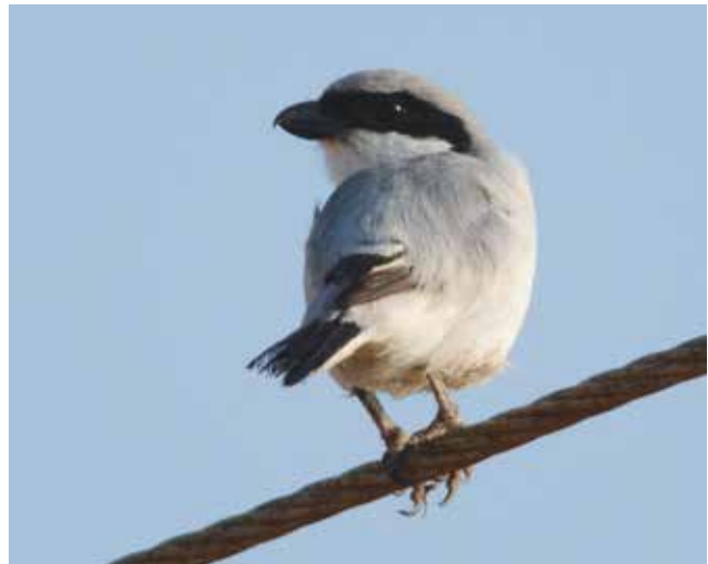
1 November 2014, Greater Rann of Kachchh, Gujarat. Note raised feathers obscuring the mantle and wings. Many times Indian Grey Shrikes have a habit of roosting/sitting like this, making it difficult to see the mantle colour and wing details.

Plumage: Dorsal colours vary from pale whitish-grey, to a dark smoky-grey. Plumage tones ranging between pale, and dark grey are more common. The rump is slightly paler than the mantle in all birds. Most adults show white scapulars. Underparts are pure white, but a few birds ( n < 5 ), showed a faint greyish / buffish wash. Often, lahtora roosts / perches with its wing, and mantle feathers raised, thus obscuring the mantle colour and wings, making it difficult to judge plumage colours and patterns. [1–1A].