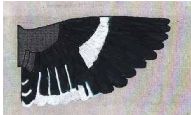
Fig. 5. Wing pattern of Great Grey Shrike—type 'c'.