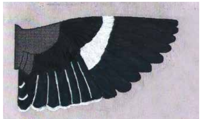
Fig. 8. Wing pattern of Great Grey Shrike L. e. aucheri .

Has uniform grey upper parts that do not get paler on the rump. Facial mask narrower, but head pattern similar to lahtora . Under parts have a distinct greyish wash. The upper-wing has a white primary patch, and almost no white on the secondaries; some birds have dark brownish secondaries. The wing pattern is said to be variable (Ali & Ripley 2001). It generally has much less white in wings and tail than do lahtora , homeyeri , or pallidirostris (Fig. 8). I have shown the inner edges of the secondaries white, but these may be fainter, or even black. Ali & Ripley (2001) state 'inner edge of inner web of secondaries usually white, rest brown but this is rather variable'. But generally there is almost no white on the secondaries, with the secondaries either black, or dark brownish. The outermost rectrice (t6) is mostly white with black on base / rachis, while the next feather (t5) is mainly black with a white tip, which differs from the other taxa discussed here.