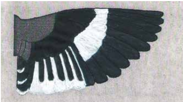
Fig. 3. Wing pattern of Great Grey Shrike—type 'a'.

Wings: The upper-wing pattern, when seen in flight, is considered important for identification, and special attention was paid to it, and whenever possible, it was photographed. Shrikes sometimes hold the inner wing semi-closed in flight, which makes it difficult to observe the pattern on the secondaries, and only a black patch is visible. But as far as possible, I tried to observe the fully stretched upper-wing in detail. I noted three types of wing patterns on lahtora (Figs. 3–5 2 ):