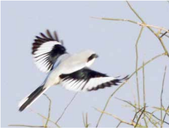
2A. February 2014. Desert National Park, Rajasthan. Same individual as above in flight. Note the extensive white on the upperwings, showing wing pattern as illustrated in Fig. 4