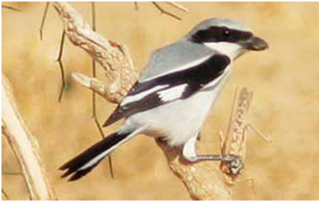
14. February 2006. Desert National Park, Rajasthan. Note the grey upperparts and rump, grayish wash to the underparts, especially flanks, which is like aucheri . But note face pattern, which is similar to lahtora and unlike aucheri . An aucheri or a probable lahtora-aucheri intergrade? This individual is very different from the birds generally seen in the area.

specimen collected from Bhawalpur, Punjab, in Pakistan (Abdulali 1977). It has not been recorded in India but careful observations of grey shrikes in north-western India may get results. A probable aucheri , or an intergrade, has been photographed in the Desert National Park, Rajasthan [14], and a specimen is discussed by Abdulali (1977), which is similar to lahtora , except for a greyish wash to the under parts. Hence intergrades may occur here and more observations are required.