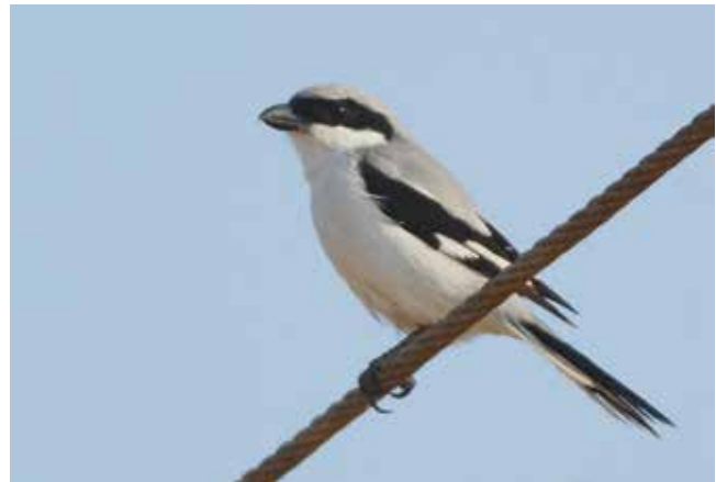
1A November 2014, Greater Rann of Kachchh, Gujarat. Same bird as in 1. Now note how the mantle and wings are clearly seen, and mantle is darker greyish.

In general, birds ( n=15 ) seen in DNP [2, 2A, 3] were pale greyish, with a paler rump. In Gujarat, they ( n>25 ) varied from pale grey to dark smoky-grey.