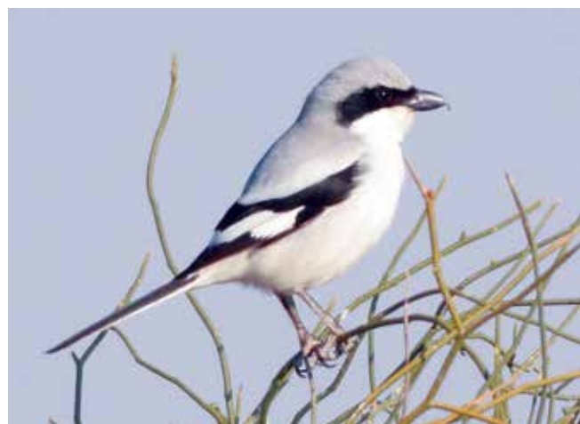
2. February 2014. Desert National Park, Rajasthan. Very pale plumage, finer mask and extensive white in wings. Note large primary patch and white secondaries.

In general, birds ( n=15 ) seen in DNP [2, 2A, 3] were pale greyish, with a paler rump. In Gujarat, they ( n>25 ) varied from pale grey to dark smoky-grey.