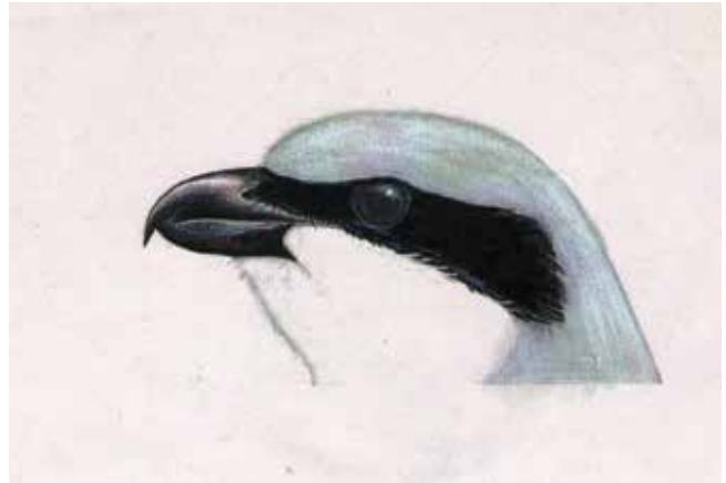
Fig. 1. Shrike head, pale.

Face pattern, and bill: Facial masks vary. Two extreme face patterns are illustrated here. The palest birds, with pale, greyish-white heads (Fig 1), show a facial mask that passes over the lores, eyes, and behind the eyes, ending at the ear coverts. The black on the lores, and forehead is restricted. The darkest birds, with a dark smoky-grey head, and mantle (Fig. 2), could show a very prominent black facial mask, almost like that of a Lesser Grey Shrike L. minor [4], with a wider-than-normal facial mask on the forehead, lores, and through the eye, extending down towards the neck. Such dark, smoky-grey plumaged birds can be seen in Rajasthan [5], and also in Gujarat. Most birds show a facial pattern that is between these two extremes. Though posture, and how position of neck (whether stretched, or not) may affect the extent of black seen behind, and above the eye, it is apparent that this is variable, with some birds showing a wider facial mask. This feature can be judged by the width of the black band over the bill (forehead), and above the eyes, when good views are obtained. Though rare, this is especially noticeable in some individuals that sport a wider facial mask. There is a faint white supercilium present on many birds, which, even if present, is not noticeable unless closely observed. The bill is heavy and black in all adult birds.