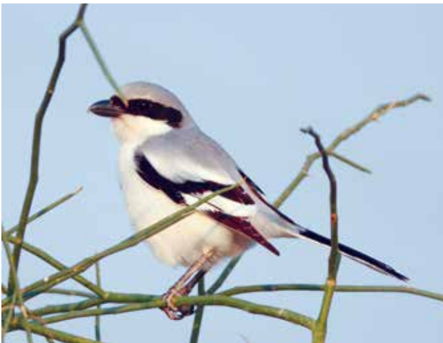
3. February 2014. Desert National Park, Rajasthan. Note the extensive white in the primaries and secondaries. Also primary projection looks much longer (more than 100%) than generally seen in lahtora . Pale plumage and narrower face mask.