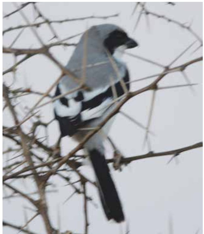
4. November 2014. Greater Rann of Kachchh, Gujarat. Note very wide and extensive mask extending well above the eye, darker grayish plumage, and much white in secondaries.