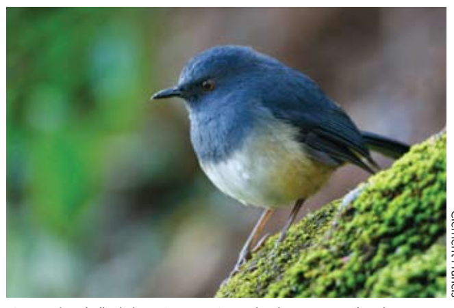
Fig. 4. Rufous-bellied Shortwing B. major, Avalanche, Ooty, Tamil Nadu.

The other conclusion that can be highlighted from this study is that evidently the species did not have a linear mode of colonisation (Fig. 2A) but, a mode that was more consistent with option B (Fig. 2B), where the species occupied lower lying areas and then moved up into the sky islands. The reason for this appears to have been global climatic events. These movements are not independent of geography, as the splits in the populations evolved merely because the topographic canvas that existed had deep valleys, like the Palghat Gap, and Shencottah Gap between these populations.