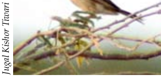
Fig. 2. Water Pipit at Kar, NW of Fulay village, Gujarat, 12th February 2007.

made a single photograph of two birds, while UGS recorded the call. JKT revisited the site on 4th March 2009 and obtained additional photo-documentation (Fig. 2). On this day there were no less than 60 Water Pipits. The pipits seem to gather for their night roosting in the long grass or somewhere nearby.