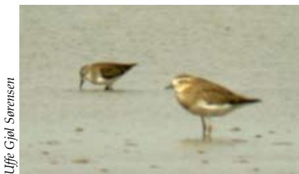
Uffe Gjøl Sørensen

Late in the afternoon, on 12th February 2007, we stopped at Kar, NW of Fulay village, in order to see pre-roosting harriers Circus spp., and around sunset the impressive flight of Common Cranes Grus grus (c. 15,000+) heading to their night roost. A characteristic 'tsip' uttered by small birds flying overhead drew the attention of UGS. Realising these to be small pipits, and the sound not being the slightly harsh, buzzing call of a Tree Pipit Anthus trivialis —the most likely small pipit to occur in Gujarat during winter—full attention was given to identify these birds. One,