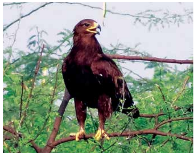
91. A close view of Greater Spotted Eagle Clanga clanga perched on Prosopis juliflora .

This prompted us to do a literature survey for the distribution of this species in Tamil Nadu. Surprisingly, except Rahmani (2012), most other regional references (Naoroji 2006; Grimmett et al. 2011; Rasmussen & Anderton 2012) do not provide more than four distributional records in Tamil Nadu. The only previous summary of its status in Tamil Nadu was by Santharam (1999), which was nearly two decades ago. Hence, we intensively searched for, and collected, information on reliable distributional records of the species in Tamil Nadu, and Puducherry from various journals, books, newspapers, avian online forums such as eBird ( http://ebird.org ), Tamilnadu Birds—Yahoo Groups