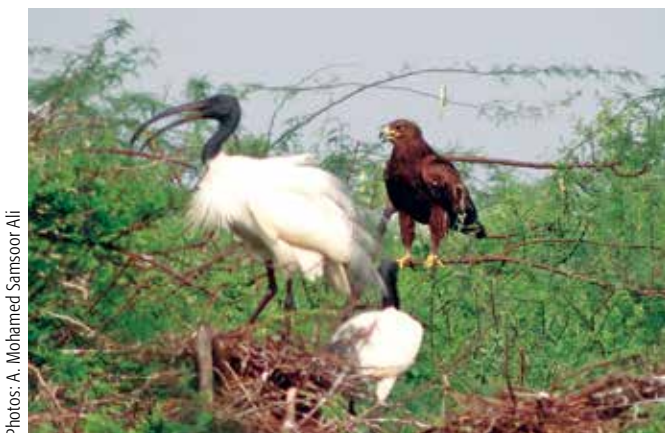
90. The Greater Spotted Eagle Clanga clanga perched on a tree Prosopis juliflora near to Black-headed Ibis Threskiornis melanocephalus nests.

It is noteworthy that Jerdon (1862–1864) reported it as a 'tolerably common' in Carnatic coasts (=the southern Indian states of Tamil Nadu, south-eastern Karnataka, north-eastern Kerala, and southern Andhra Pradesh) in the nineteenth-century, a statement that is used later by both, Ali & Ripley (2007), and Naoroji (2006) to suggest a decline since then. But with the availability of modern photographic equipment in the hands of good photographers, and an increasing number of naturalists, there are many winter sight records of this species from various parts of Tamil Nadu. Admittedly, all the sight records cannot be validated independently, and the possible confusion with the scarcer, resident Indian Spotted Eagle C. hastata , or the much rarer dark morph of Tawny Eagle Aquila rapax , remains. However, field techniques of bird-watchers have improved dramatically in the last few years due to the sheer number of photographs