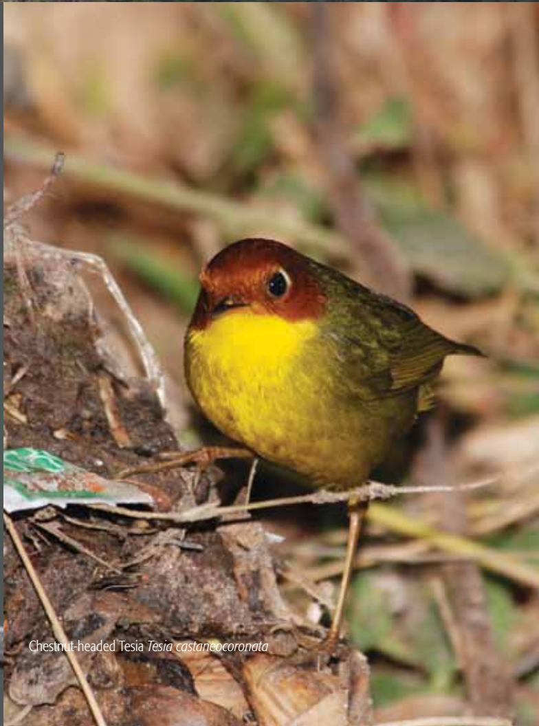
Chestnut-headed Tesia Tesia castaneocoronata