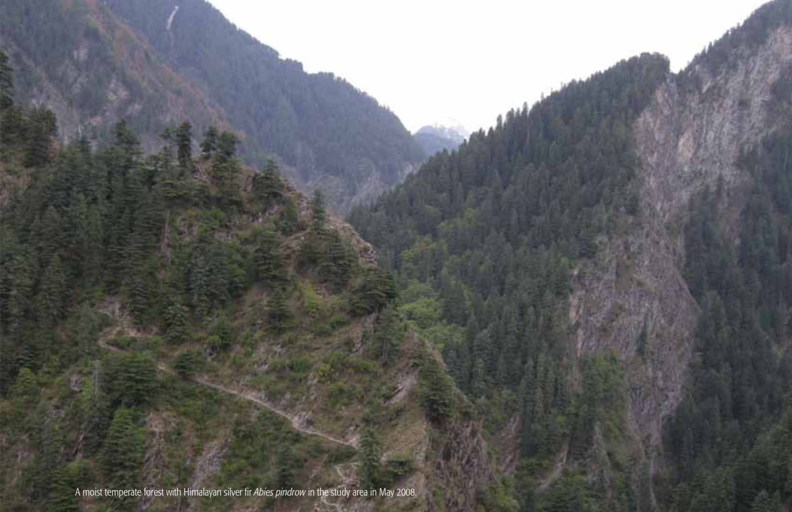
A moist temperate forest with Himalayan silver fir Abies pindrow in the study area in May 2008.