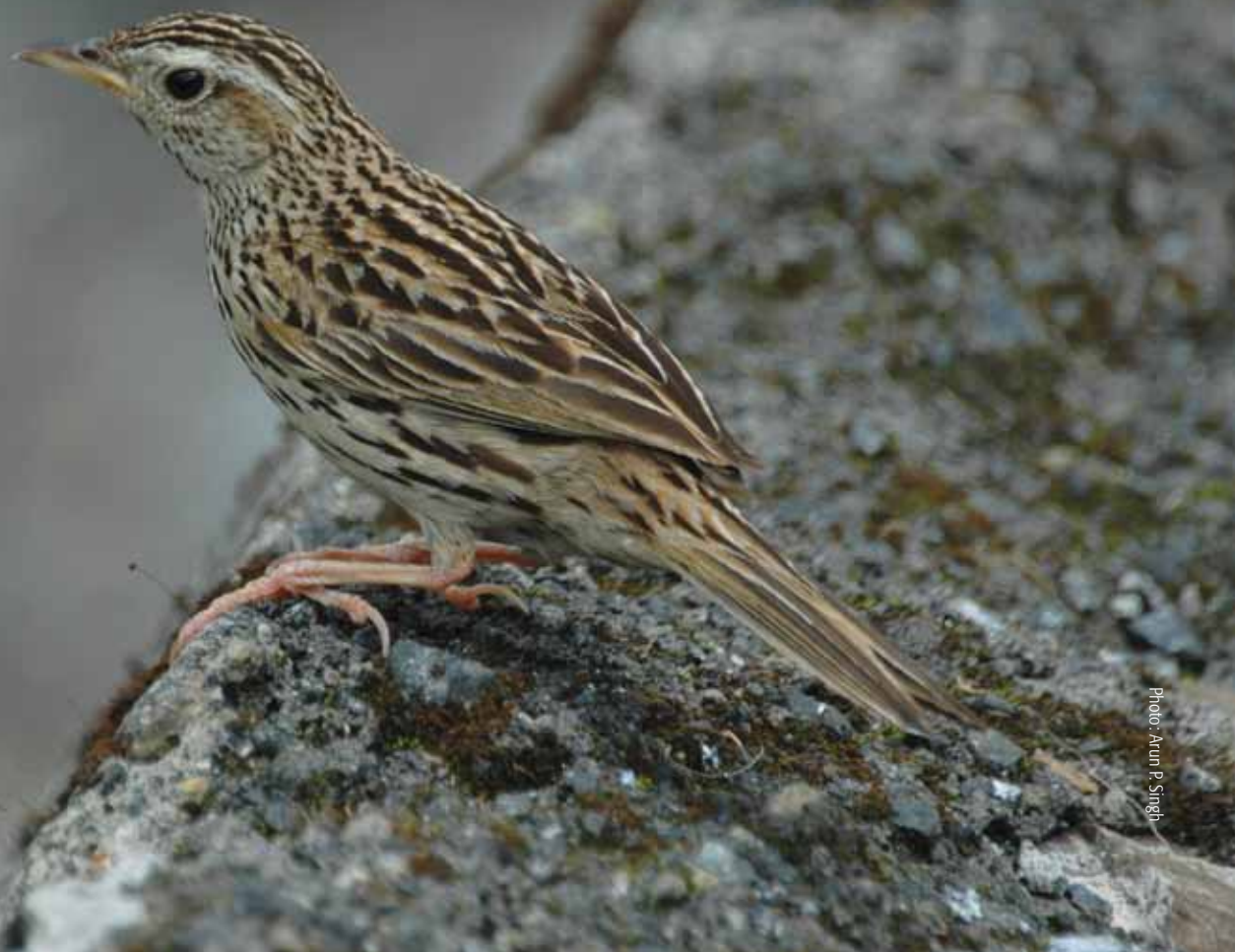
Upland Pipit Anthus sylvanus