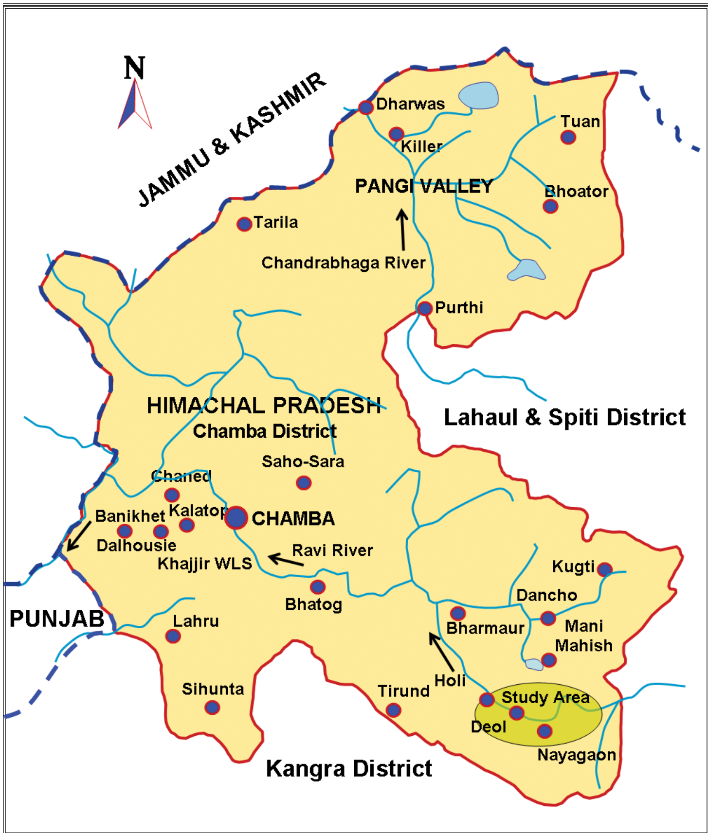
Fig. 1. Map of Chamba district depicting the study area and locations of sites as mentioned in the text.