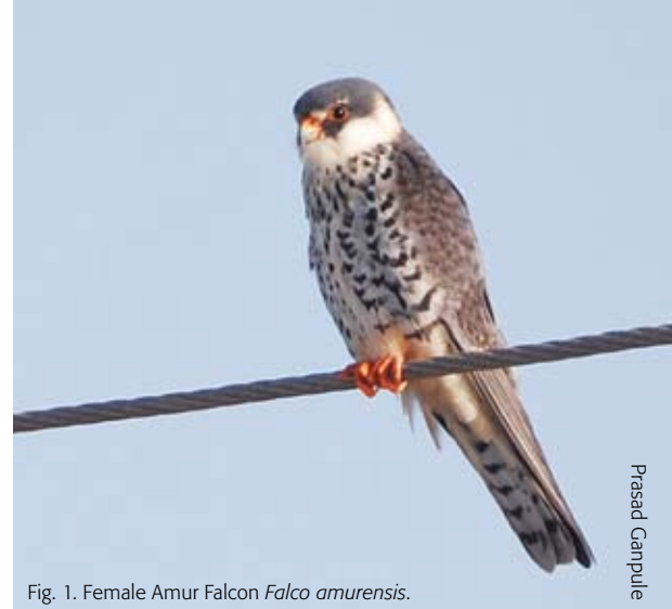
Fig. 1. Female Amur Falcon Falco amurensis .